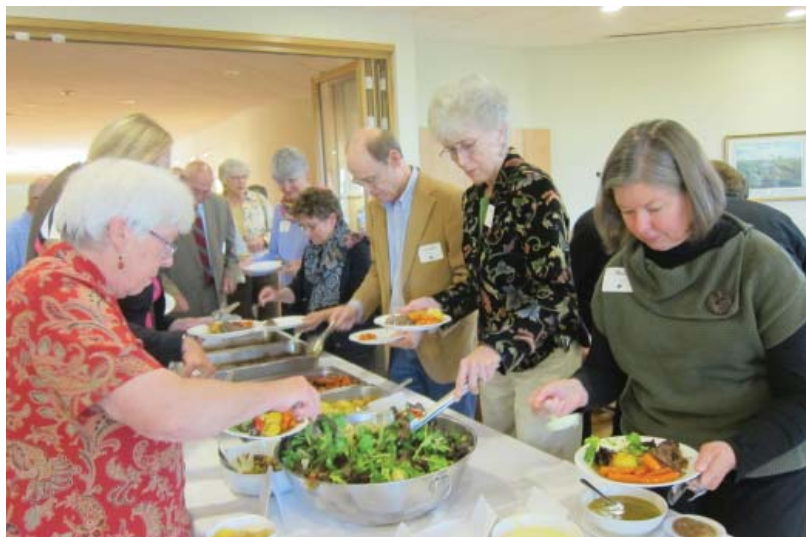
Supporters of Holy Wisdom Monastery share community and healthy food at the Scholastica Sustainers and Benedict Society dinner, September 2013.